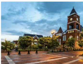
Dallas, GA Courthouse