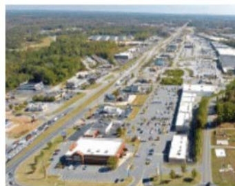
Aerial View of 278 Corridor

3736 ATLANTA HIGHWAY, SUITE E, HIRAM GA 30141